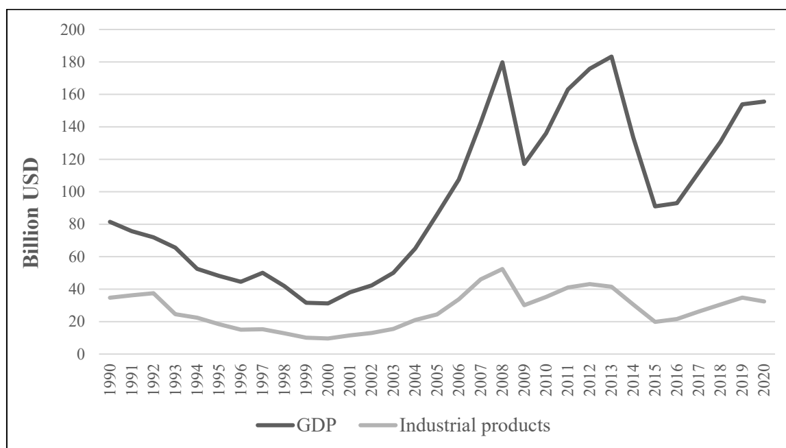
Figure 1. Dynamics of GDP and industrial products of Ukraine for 1990–2020, billion USD